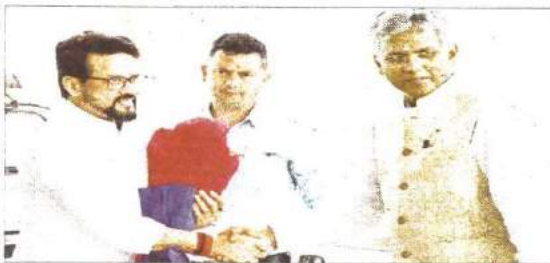
आईआईएम के निदेशक केंद्रीय मंत्री का स्वागत करते हुए।

ठाकुर बुधवार को आईआईएम जगती परिसर में विकसित भारत अंबेसडर मीट अप जम्मू कार्यक्रम में बोल रहे थे। केंद्रीय मंत्री ठाकुर ने