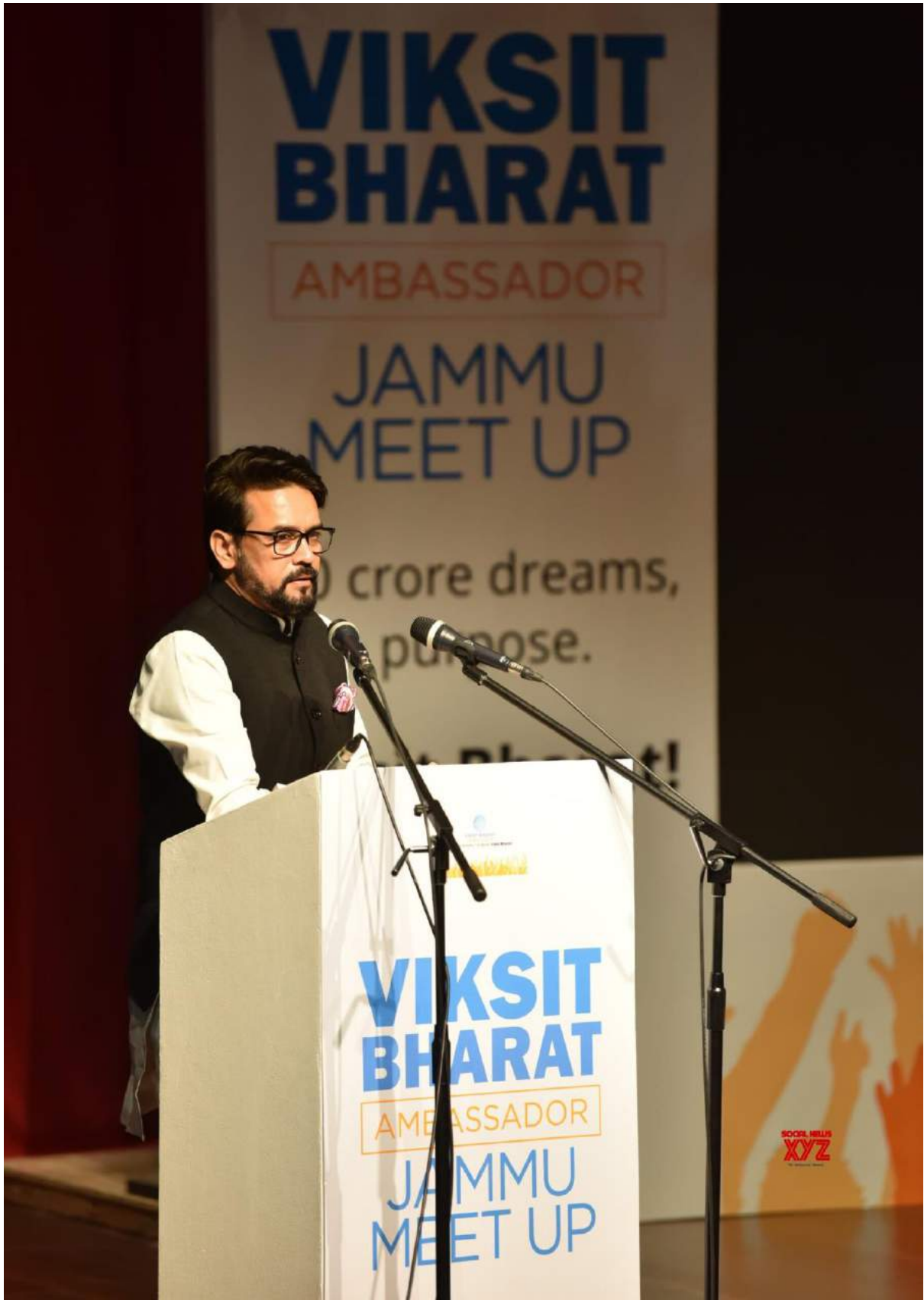
Jammu: Union Minister Anurag Thakur addresses at the Viksit Bharat Ambassador Meetup, in Jammu, Wednesday, March 27, 2024.