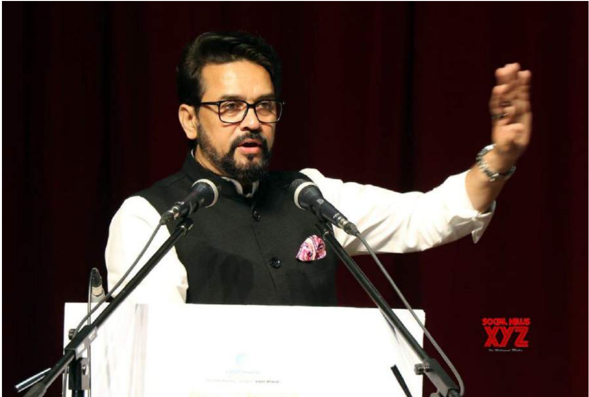
Jammu: Union Minister Anurag Thakur addresses at the Viksit Bharat