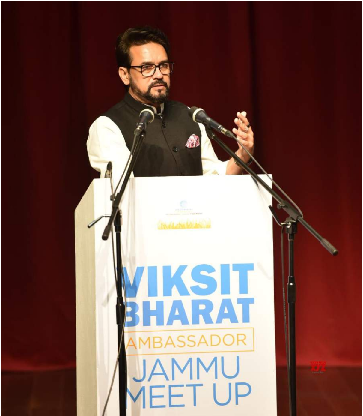
Jammu: Union Minister Anurag Thakur addresses at the Viksit Bharat Ambassador Meetup, in Jammu, Wednesday,