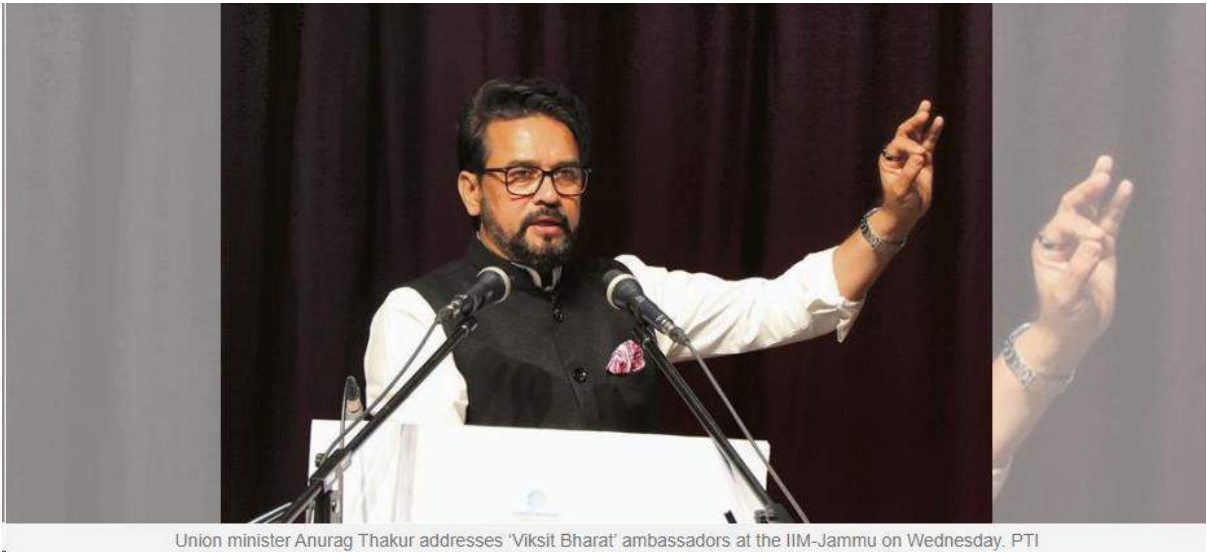
Union minister Anurag Thakur addresses 'Viksit Bharat' ambassadors at the IIM-Jammu on Wednesday.

World paying heed to India's advances in digital sphere: Anurag Thakur